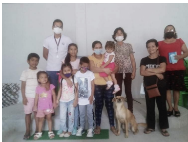
CHURCH PEOPLE FROM OUR CHURCH

Therefore, I am putting plans in place for me to return to Peru alone, leaving my wife and family in the States, while I attempt to determine, 1) if and when our family can safely return to Peru, and 2) when the restrictions will be lifted and we can visit door to door, share the Gospel, have services, and continue building the church.